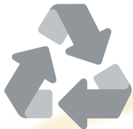
Zero Waste Event

The primary purpose of the Integrative Wellness EXPO & Conferences is to provide an educational and inspirational wellness platform for the global community.